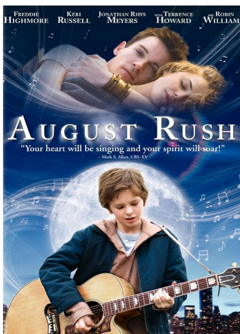
Monday, Feb. 6 at 7:00 P.M.