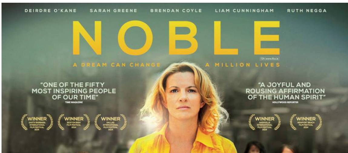
Monday, April 3 at 7:00 P.M.