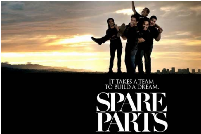
Monday, March 6 at 7:00 P.M.