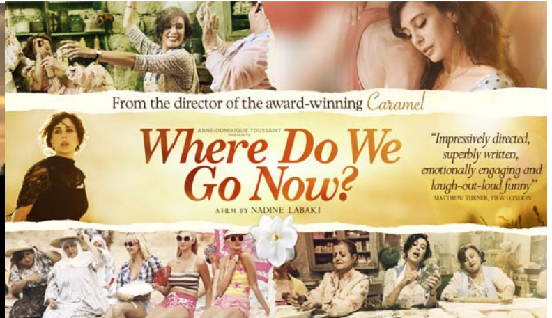
Monday, March 20 at 7:00 P.M.